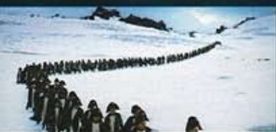
...marching across these ice-fields for days.